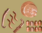
Resistance Welding Products