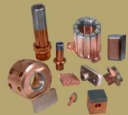
Electrical Switchgear Contacts